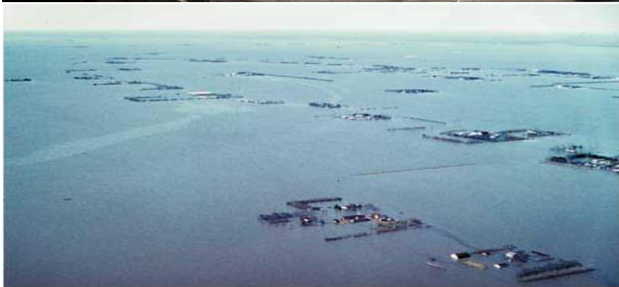
Flood Image: Winnipeg flood, 1997.