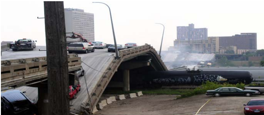
Bridge Image: I-35W Bridge Collapse, Minneapolis, MN, August 1, 2007.